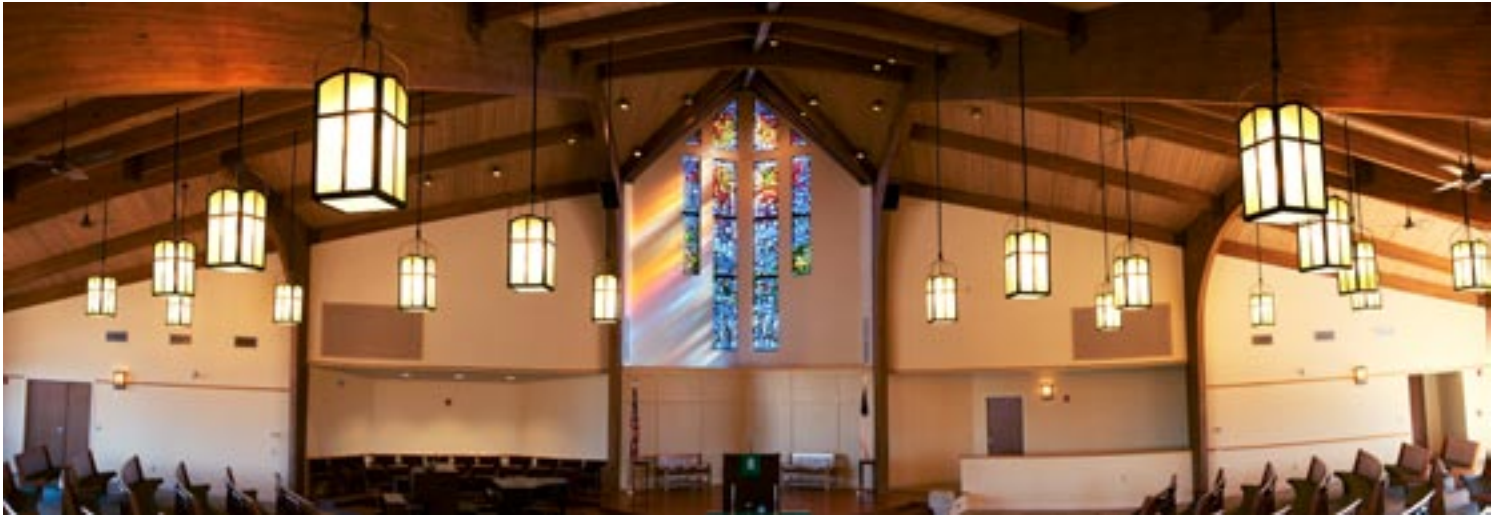
Presbyterian Church of Chestertown, Maryland