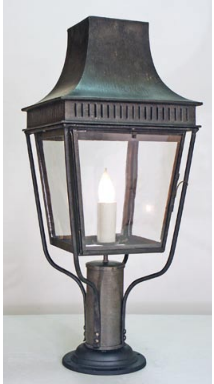
L-1692-P on a Pedestal Mount

Overall height is 26 1/2" Lantern is 18" high x 11" square 1 medium socket, 100 watt max