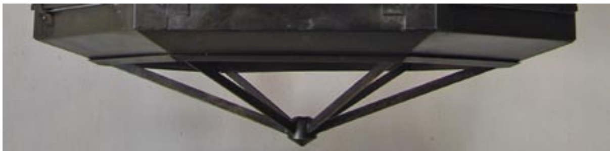
L-9800 detail showing custom grill work to add definition to the open bottom