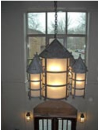
St Andrews School Middletown Delaware