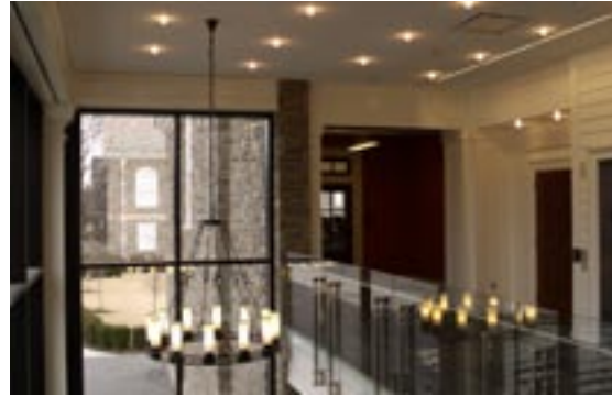
Penn Charter School Philadelphia Pennsylvania

While we are known for our residential lighting, increasingly we're added churches, schools, and golf course club houses to our repertoire