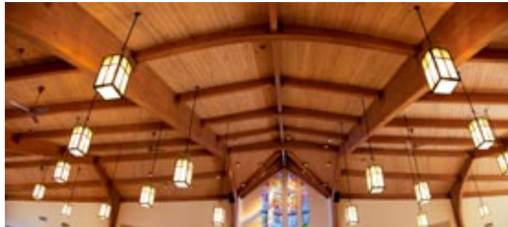
Presbyterian Church of Chestertown Maryland