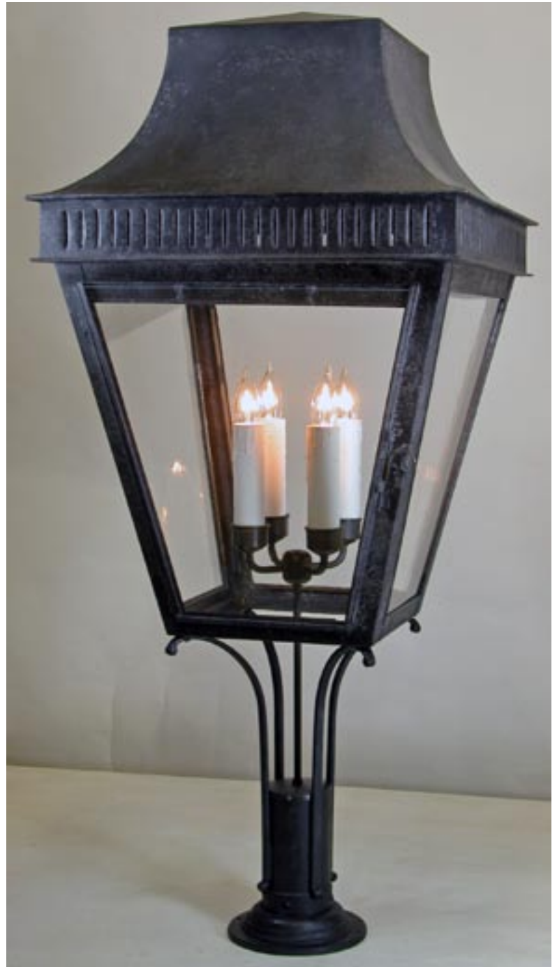
L-1691G-P40.2 on a Pedestal Mount

Note - the post height would be made to your specifications.